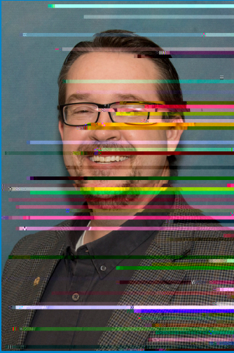
D. S. F. D., S., M., & S.